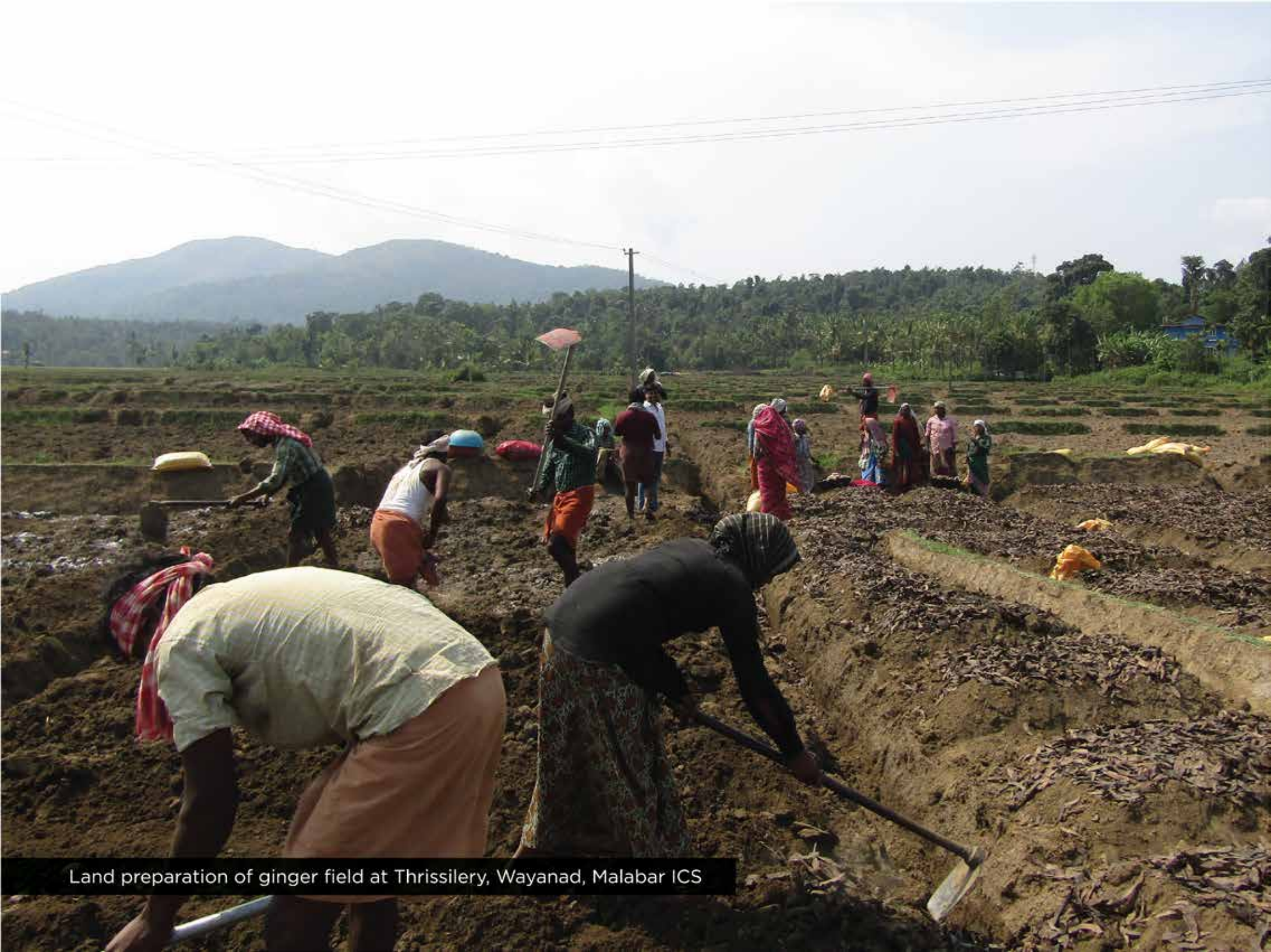
Land preparation of ginger field at Thrissilery, Wayanad, Malabar ICS