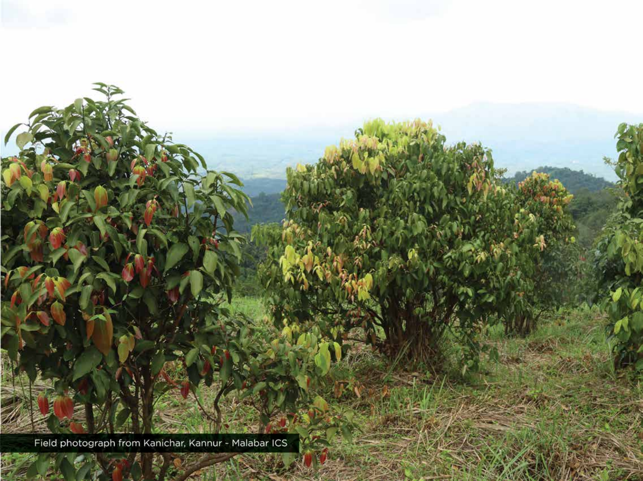
Field photograph from Kanichar, Kannur - Malabar ICS