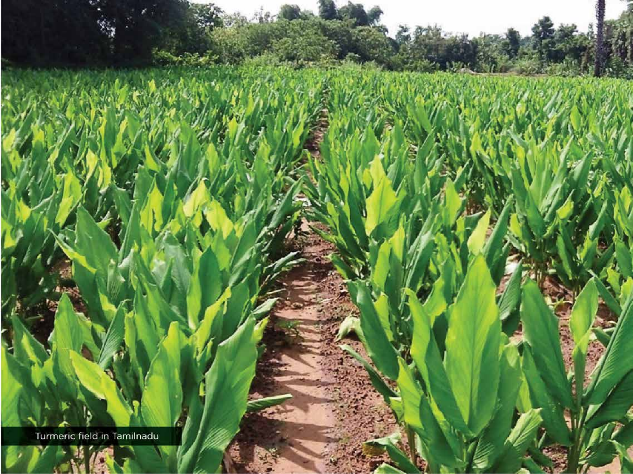
Turmeric field in Tamilnadu