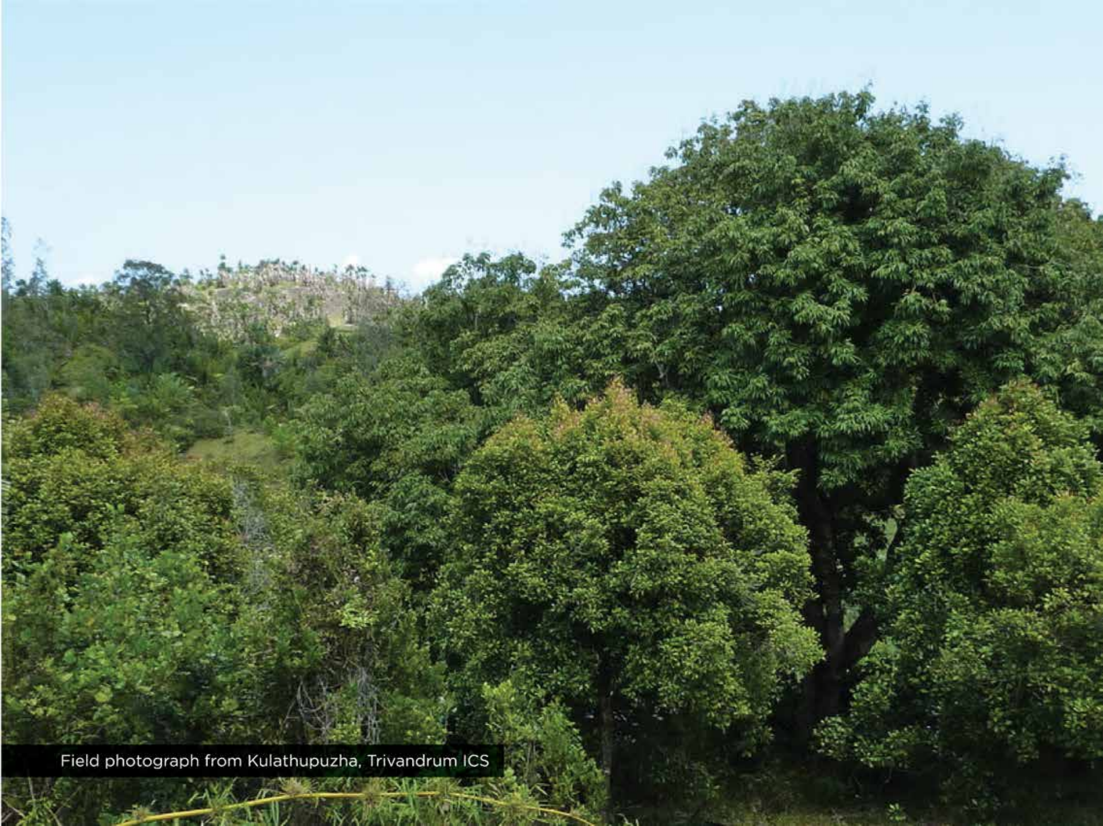
Field photograph from Kulathupuzha, Trivandrum ICS