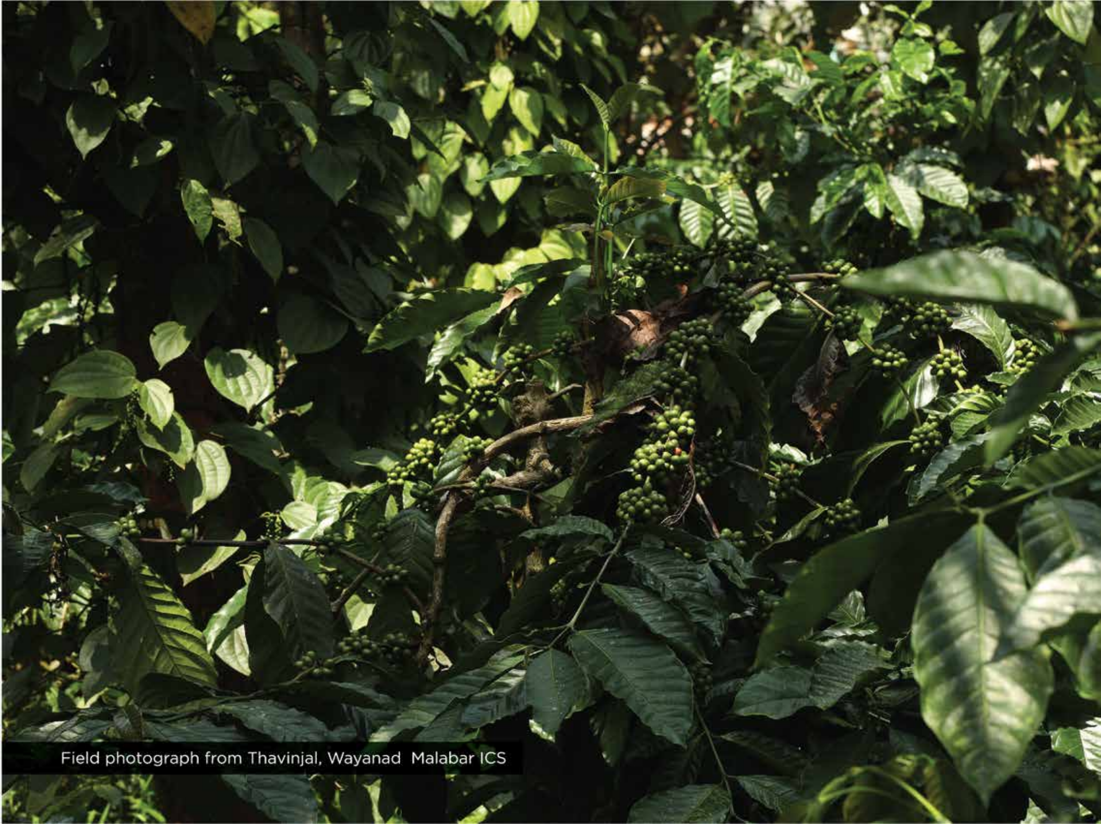
Field photograph from Thavinjal, Wayanad Malabar ICS