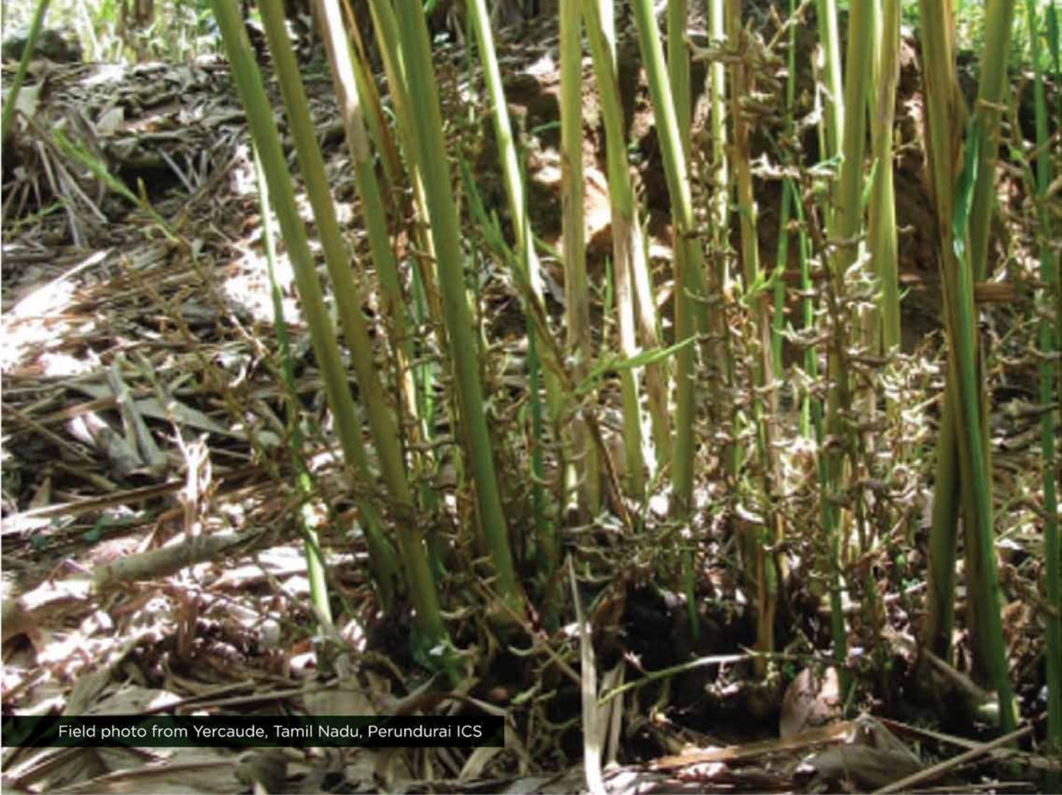
Field photo from Yercaude, Tamil Nadu, Perundurair ICS