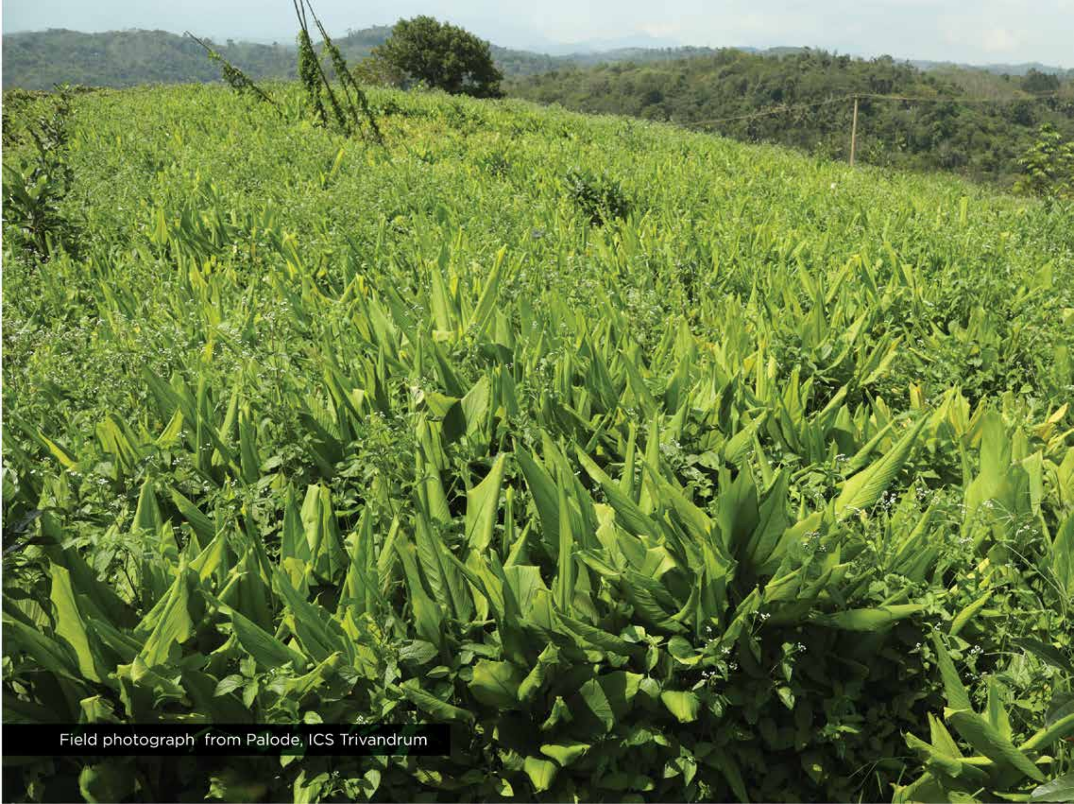
Field photograph from Palode, ICS Trivandrum