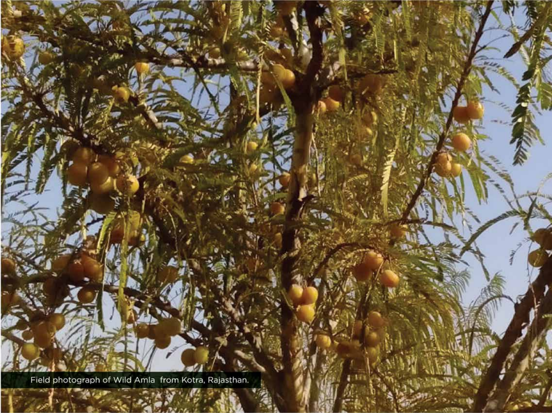
Field photograph of Wild Amla from Kotra, Rajasthan.