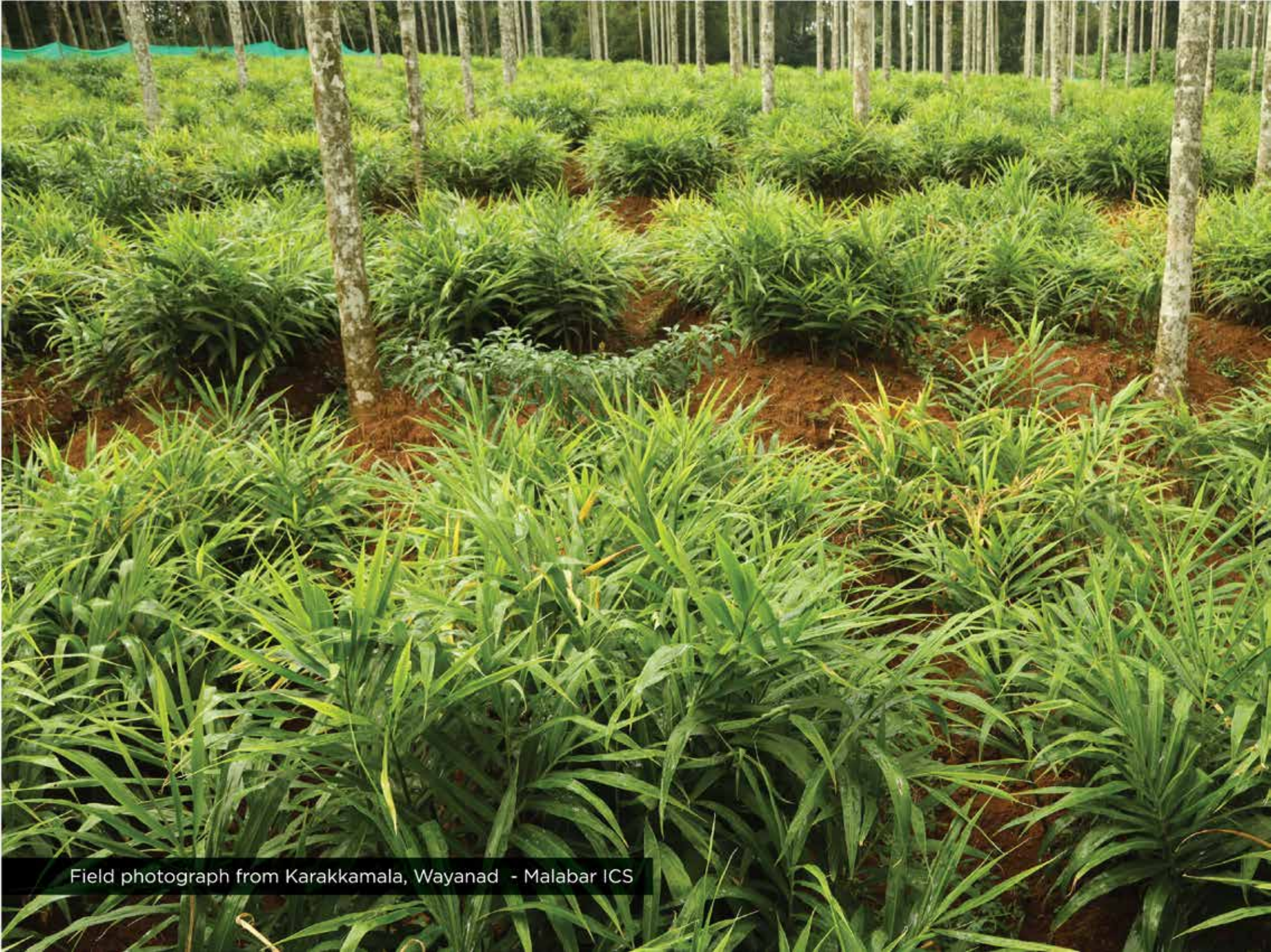
Field photograph from Karakkamala, Wayanad - Malabar ICS