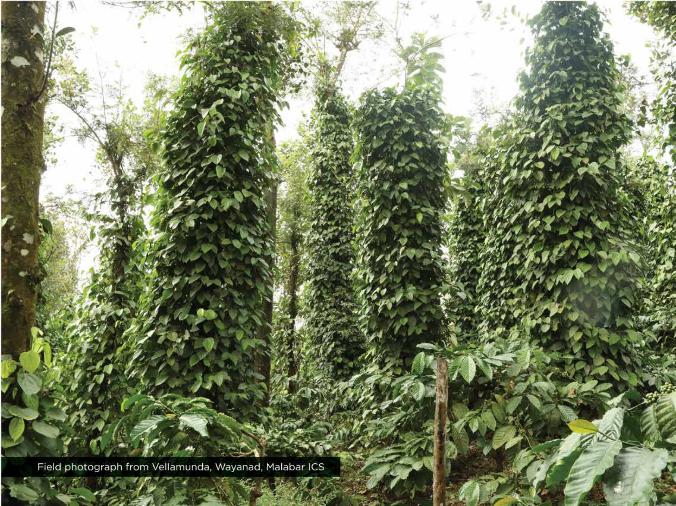
Field photograph from Vellamunda, Wayanad, Malabar ICS